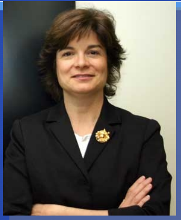
Carolyn Porco Public Talk at Boulder, 2008.