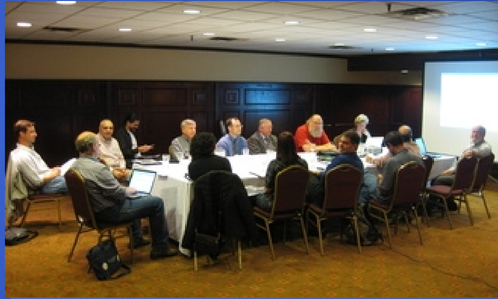
Committee Meeting during 2010 Boston Meeting