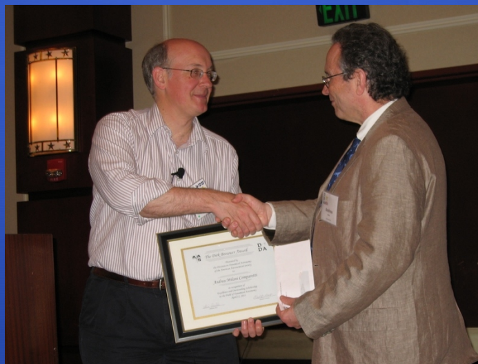
Award Ceremony at 2011 Austin Meeting